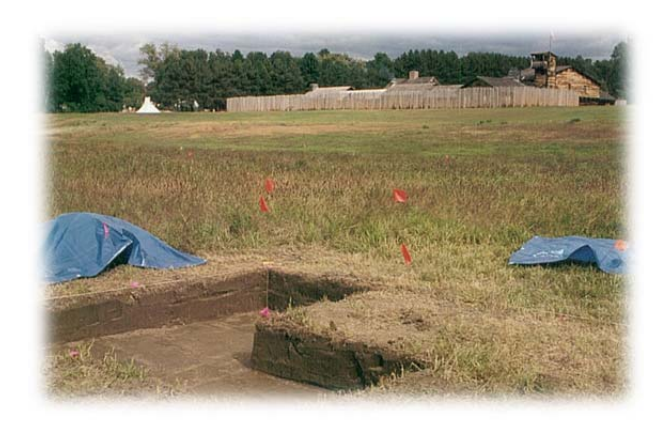
<u>Above:</u> Archaeological Excavation at Fort No. 4, in Charlestown.

witness to early settlers whose homes were abandoned as families moved downhill or were destroyed by fire. Investigation of these areas, as well as the dock sites which once lined the banks of the Connecticut River and prehistoric sites, yield much useful information. The record of these ancient times is fragile; much has already been lost through vandalism, rebuilding and new development, agricultural activity, road construction, and the inherent acidic nature of waterfront soils. Since this report deals primarily with the region's architecture, investigation by qualified archeologists is necessary to determine the actual potential of these areas.