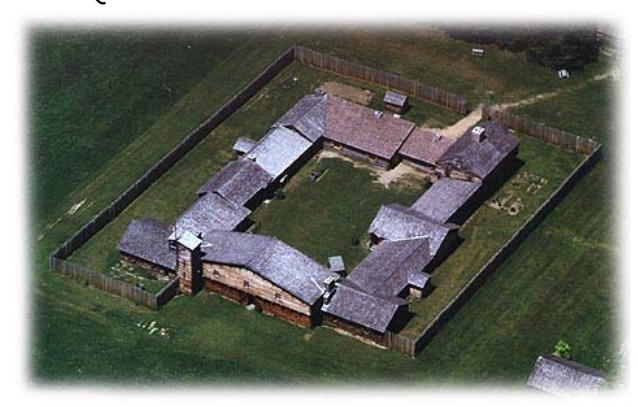
Above: Fort No. 4 in Charlestown, New Hampshire

Charlestown, earlier known as Number 4 (a.k.a. Fort No. 4), was the first town in the Region, chartered by Massachusetts in 1735. As frontier town for twenty years beginning in the 1740's, Fort No. 4 was part of a cordon of forts,, including Chesterfield (No. 1), Westwood (No. 2), Walpole (No. 3), which protected the region from long-standing incursions by the French from Ouebec and Native allies.