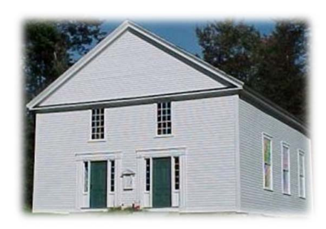
<u>Above:</u> Meeting House in Washington,New Hampshire

A humble and picturesque building in the southern part of the Town of Washington, NH is honored as the Mother Church of the Seventh-day Adventists. Today, they are a world-wide denomination with over eleven million members with churches in over 200 countries. The meeting house was built in 1842 by a local group of farmers calling themselves Christian Brethren, who dissented sharply from the strict Congregationalism of the Church in Washington Center. Many of the Christian Brethren became Adventists about the time this building was first used. Seventh-day Adventists are a Christian Protestant denomination distinguished by its observance of Saturday, the original seventh day of the Judeo-Christian week, as the Sabbath and by its emphasis on the imminent second coming of Jesus Christ. The sect is also known for its emphasis on diet and health and lead early movements for reform of healthcare and the creation of hospitals.